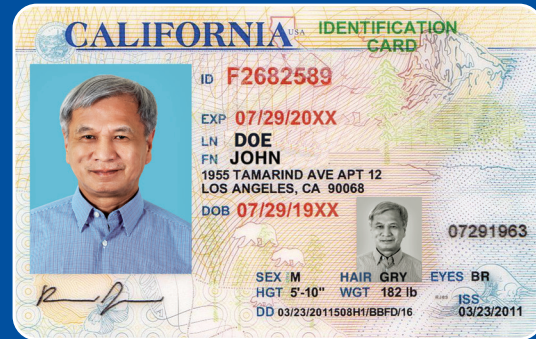
California Driver's License/ID (Age 65+)