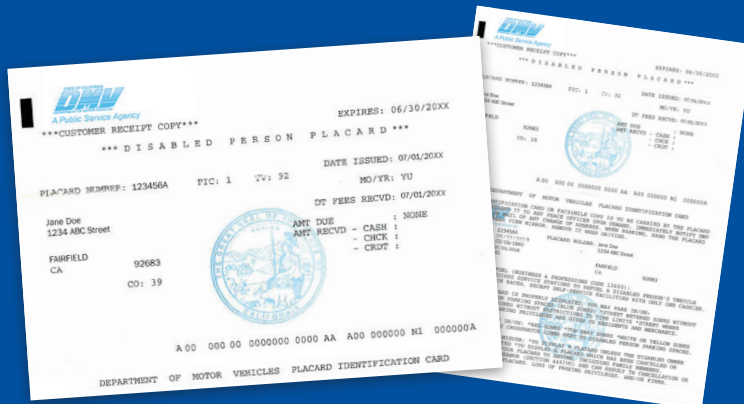
DMV Disabled License Registration w/photo ID DMV Disabled Parking Placard Registration w/photo ID