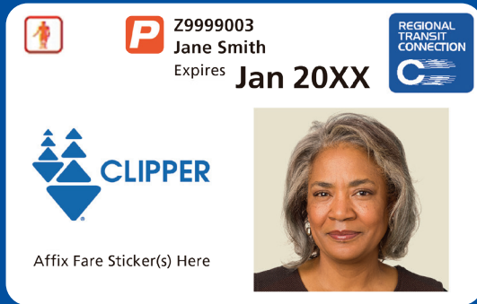
Regional Transit Connection (RTC) Card

Senior (65+)/Disabled/Medicare (SDM) passengers must show one of the following forms of ID when boarding the bus: